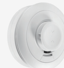
SMKT-900 Smoke/Heat/ Freeze Detector