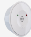
GB1E-900 Glass Break Detector